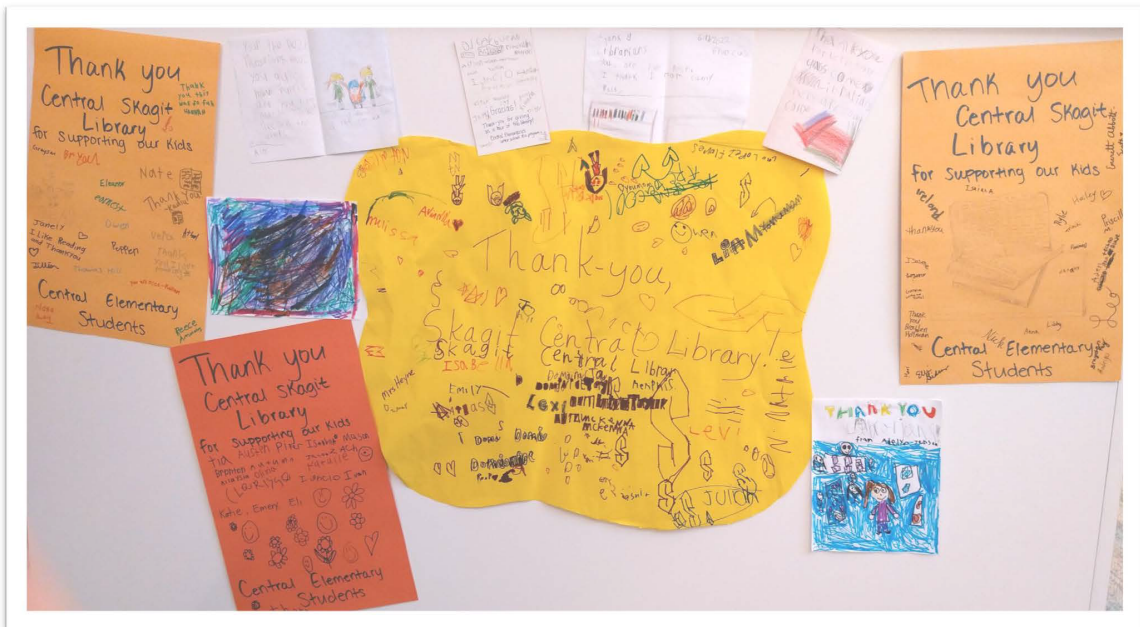
2021-2022 Library Report to the Skagit County Board of Commissioners 8