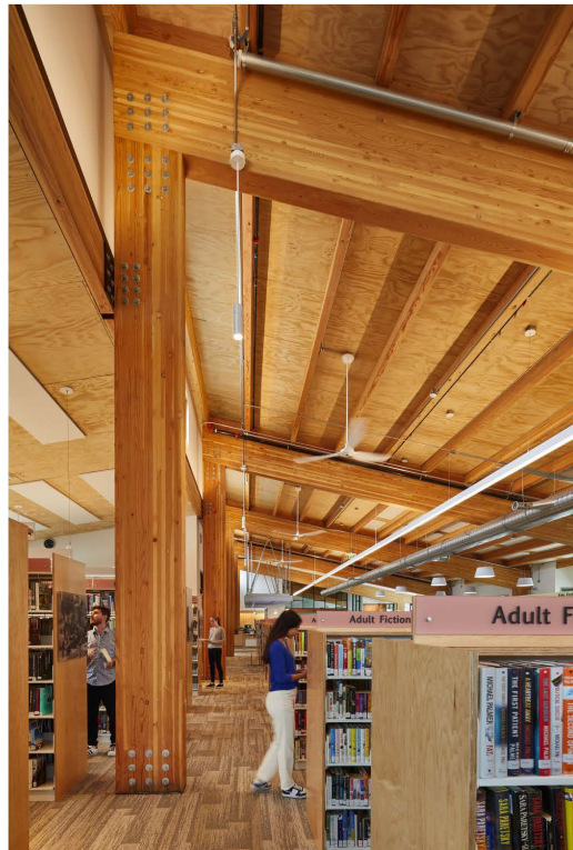
2021-2022 Library Report to the Skagit County Board of Commissioners 7