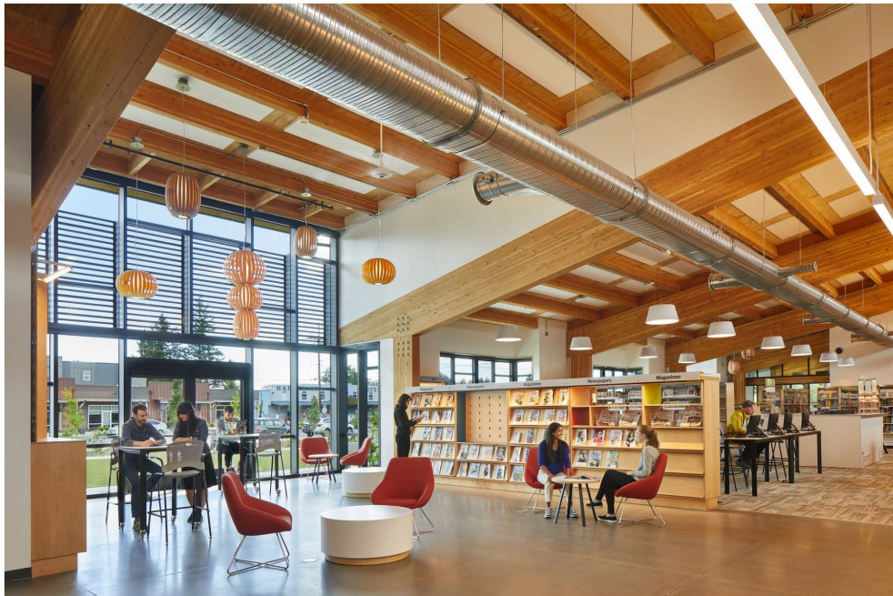
2021-2022 Library Report to the Skagit County Board of Commissioners 6